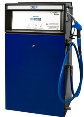
Warm Weather Model