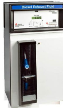
Cold Weather Model